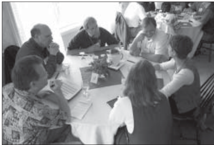
Seminar participants engage in small group discussions about theological teaching and learning.

“Theological schools exist within a rapidly changing church and culture where the inherited patterns of institutional life are up for grabs.”