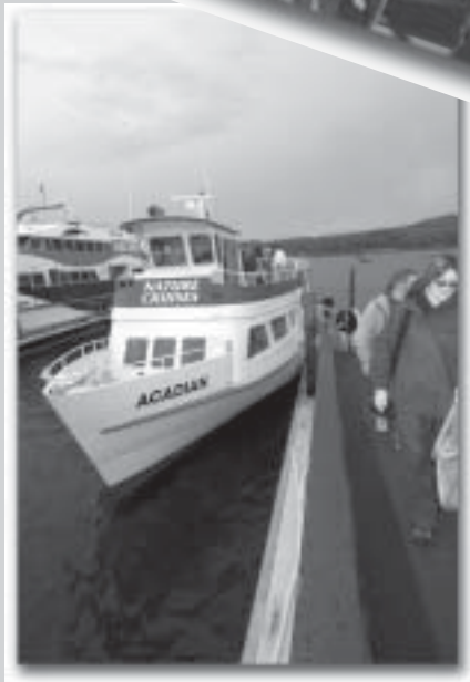
Summer activities include above left, a boat tour of the harbor aboard at left, The Arcadia. Above right, conversations on the deck of the Asticou Inn. At right, hiking and bird-watching with guide. Below left, daily morning worship is held in a green and white striped tent. Below right, a small group session during the Seminar.