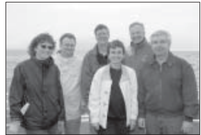
2005 Participant Teams Above, Bethany Theological Seminary, (above right) Eastern Mennonite Seminary, (at right) Episcopal Theological Seminary of the Southwest, (below) Trinity Lutheran Theological Seminary, (below right) Wartburg Theological Seminary.