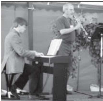
Musicians lead worship.